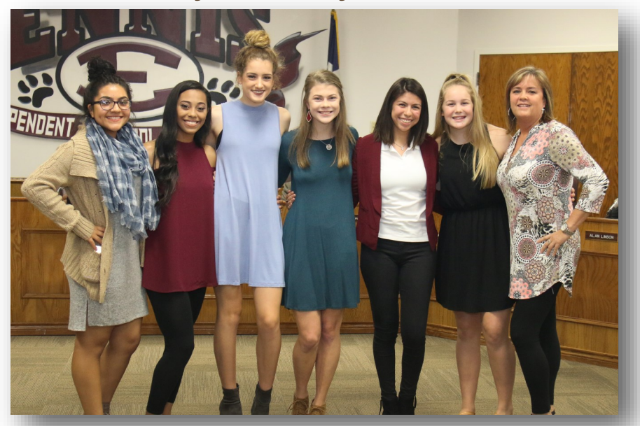
The Lady Lion Volleyball Team was recognized for their successful season and for making it to the playoffs.