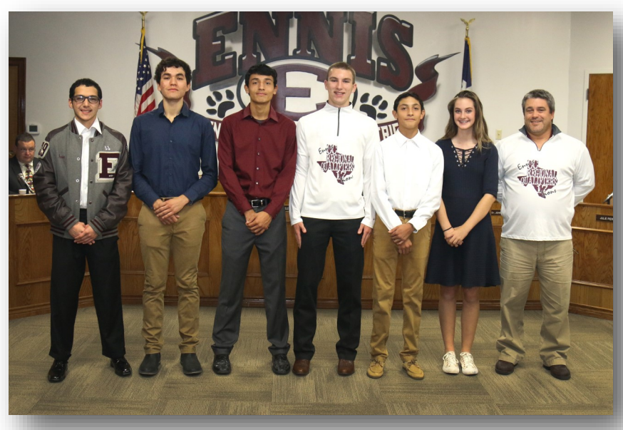
The Varsity Boys Cross Country Team was recognized for their success during the season and becoming Regional Qualifiers.